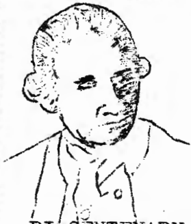
BI-CENTENARY CAPTAIN COOK 29th April 1770 — 1970