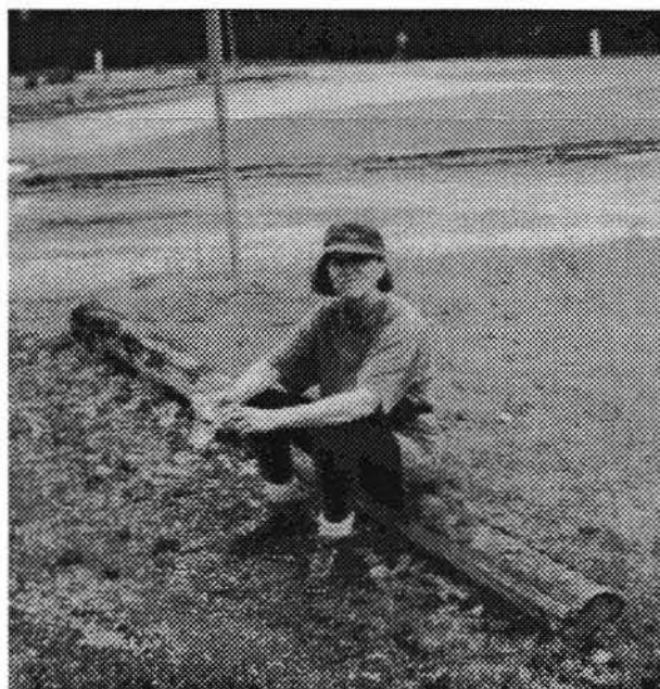
Enjoying the flora and fauna at Fraser NP