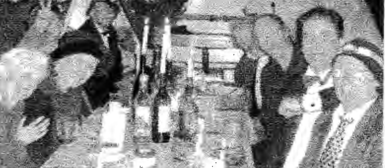
... and not forgetting the fine wines, liqueurs and port.