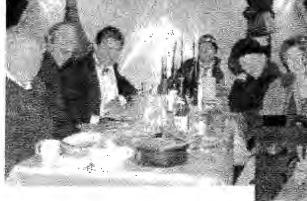
Group revellers tuck into the gourmet courses - beef curry with rice & condiments, turkey breasts, baked snapper, fresh prawn coleslaw, cheeses, and yummy desserts & cakes, including Deb's spectacular chocolate ripple cake made on the premises, with fresh whipped cream...