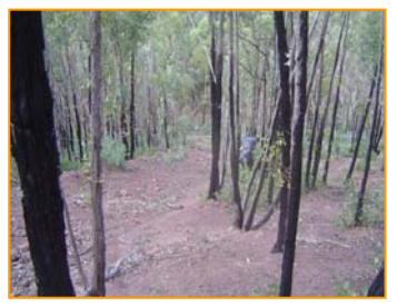
deserved the description "ordeal" for me, but the steep descent to the other

When we made our way up a steep spur to Bruni Knob the sun was already burning down again and we did not miss the campfire Ian had considerately lit for breakfast. The last 200m before the ridge top