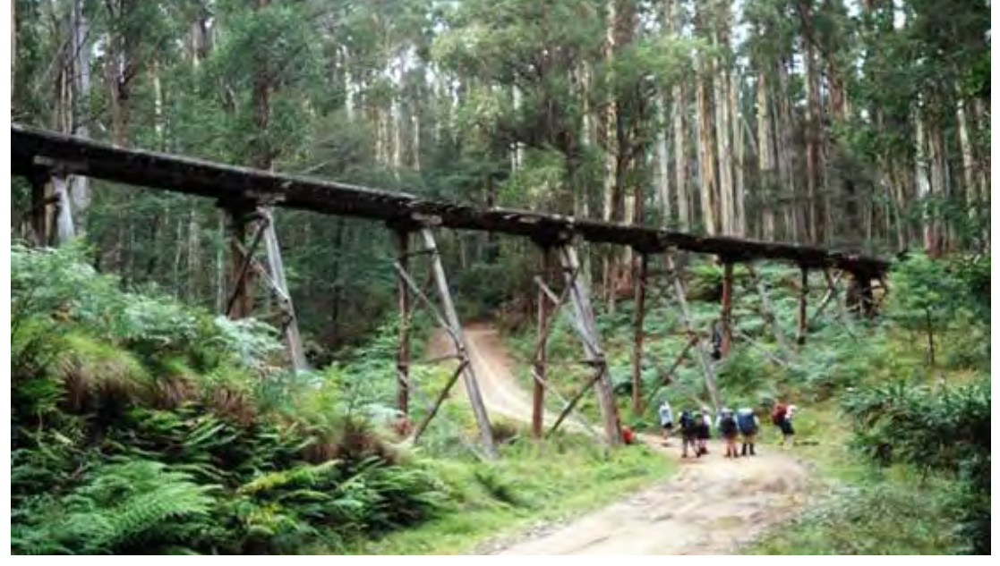
Old trestle bridge, Upper Rubicon

We drove the cars as far as practicable and set out at about 900 metres in steady rain. As we climbed little patches of snow were seen in the gullies, but nothing of any consequence. We reached the main part of the climb at Barnewall Plains in a slight mist and light rain. There were a few dark mutterings about whether the climb was really worth doing but the challenge prevailed and we were off. The climb was very steep and the little patches of snow we encountered earlier were becoming widespread and much deeper. Eventually at about 1300m the track was basically an untouched white ribbon broken only by the footprints of a wombat. The atmosphere was magical.