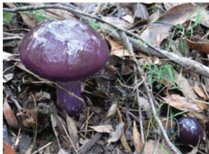
Colourful fungi – maybe Cortinarius archeri

There should even be time to dip a toe or two in the river if the feeling takes you!