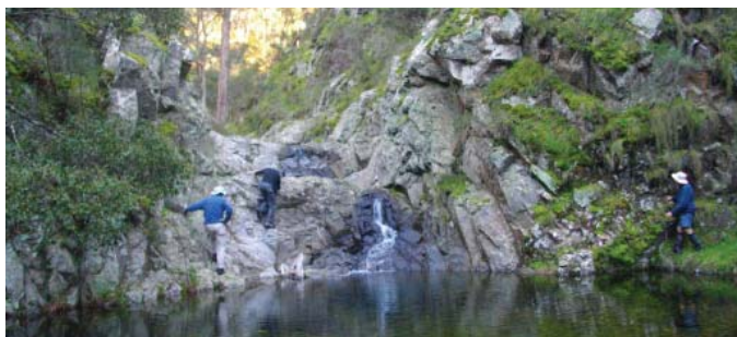
Lerderderg Gorge

There is also the opportunity to attend a Bush Dance on the Saturday night (with the Emu Creek Bush Band), so come along for a fun relaxing weekend.