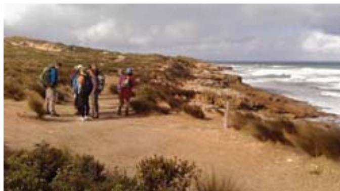
A regular head count.

Details of this walk are on page 4 of this newsletter.