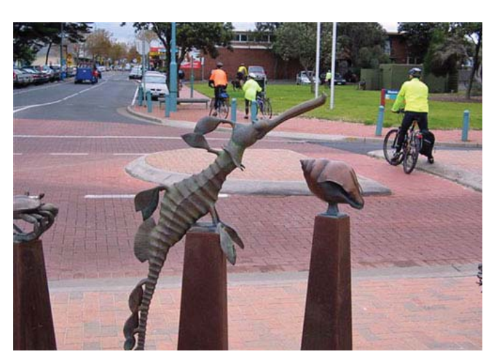
Some of the marine life sculptures at Altona Beach

Federation. After lunch we cross Laverton Creek and follow the Esplanade to Altona or Seaholme Station. There are a number of cafés in the Altona precinct for afternoon tea.