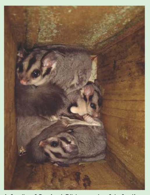
A family of Squirrel Gliders rest safely for the day in one of our nest boxes. The boxes are a virtual 'motel chain' of safe havens all across the district!