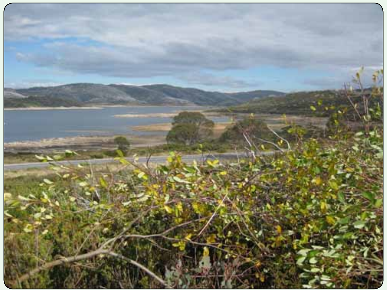
Looking over a tangle of felled willow branches to Rocky Valley Dam