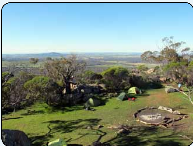
Campsite on top of Mt Kooyoora