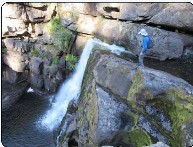
The first major waterfall on Shaws Creek