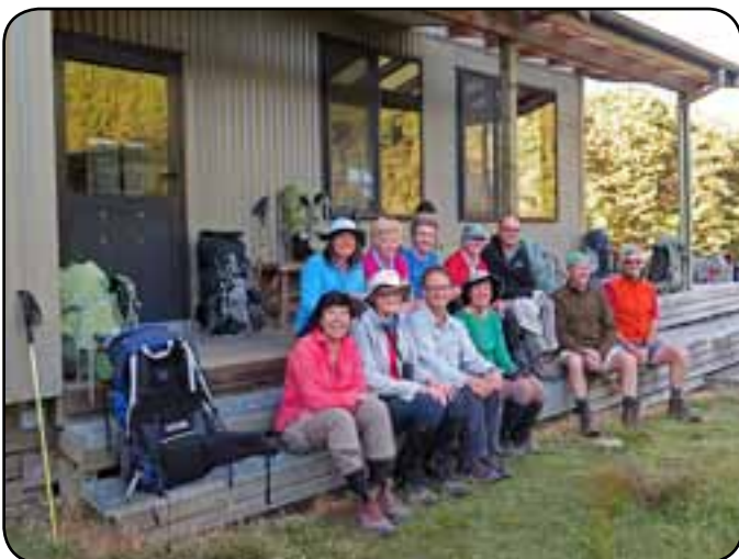
Day 5 continued the fine weather as we set out from Greenstone Hut.