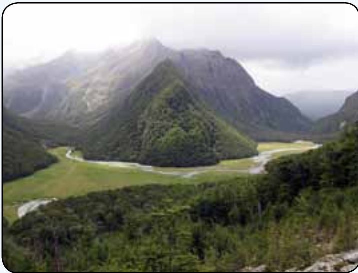
As we climbed higher there were great views down to the Routeburn Flats and adjacent valleys.

Having run the gauntlet of the New Zealand customs officials at the airport on arrival, in the process sacrificing some dehydrated peas, eleven Melbourne Bushwalkers made it to the safety of the Queenstown Lakefront YHA. After a day to stock up on provisions, sort out our packs, and have a brisk training walk up and down the Queenstown Hill (for the keen ones), we were up bright and early the next morning to catch the bus to the start of the Routeburn Track via Glenorchy. Grey clouds and increasing drizzle couldn't dampen our enthusiasm: we pulled on our wet weather gear, submitted to our leader's pack weighing ritual, and set off along the track through ferns and mossy forest.