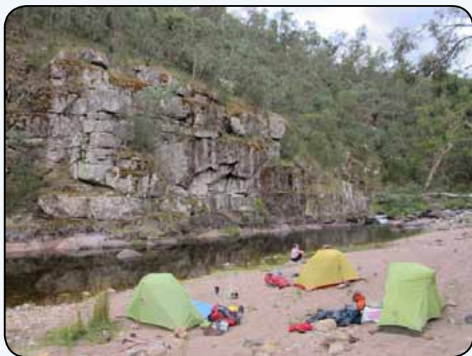
Our idyllic campsite on the Moroka River

Friday Afternoon most of us got to the campsite Currawong No 4 on the Wellington River. After a good night's sleep we were keen to get going, so it was into the cars and off to Neilson Crags car park for a half day walk. On the way we stopped at a lookout to see the local peaks with the morning mist filling up the valleys. We got to the Doolans Plain Road, which was OK until it became narrow with small saplings over it, but we pushed on then we came across a bigger sapling we could not drive over, so with some people power and huffing and puffing we slid it in to the bush.