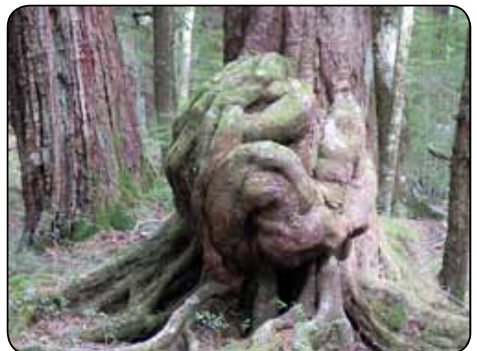
A remnant of Middle Earth?