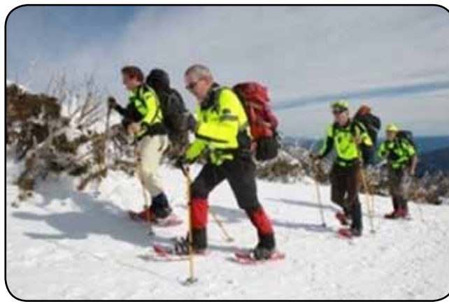
BSAR volunteers on Eskdale Spur search