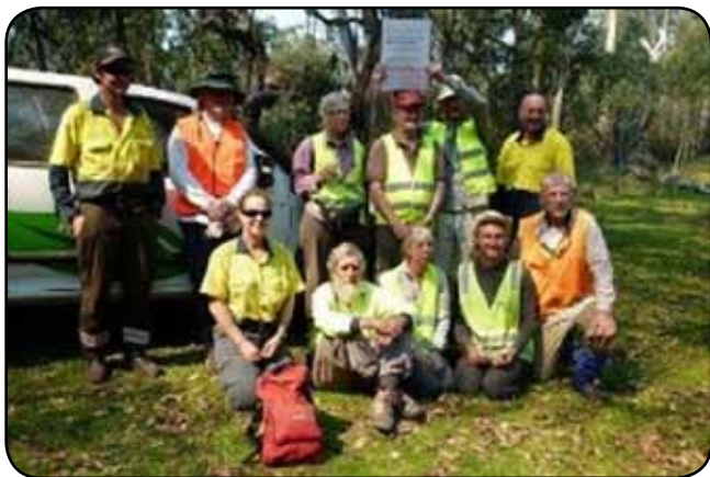
BTAC volunteers who worked on AAWT 2014

For more information on Bushwalking Victoria activities in 2014–2015 go to: http://www.bushwalkingvictoria.org.au/annual-report.html