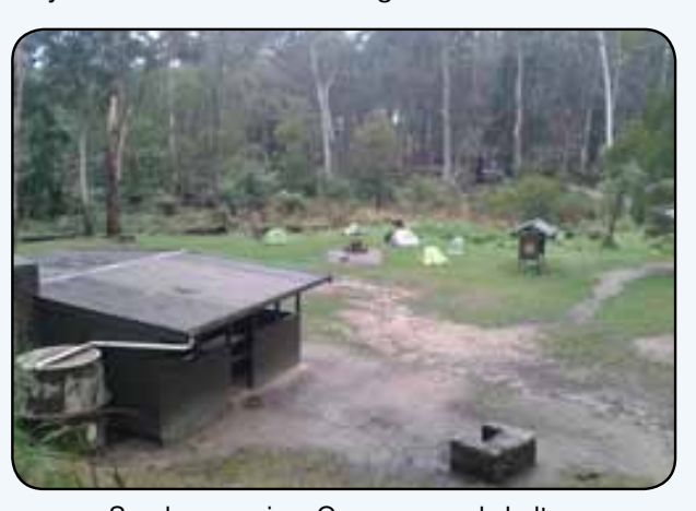
Sunday morning. Our camp and shelter.

was also a very unexpected 'god-like moment' where a comment made about the beautiful views seen during the walk preview was soon followed by a clearing of the clouds to provide a clear view of the surrounding valley and wind turbines in the distance. Given that the clouds had not cleared all morning, this was a 'WOW' moment for the walkers.