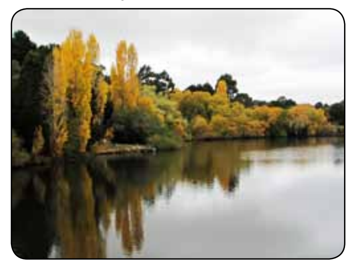
Daylesford Lake in autumn

Daylesford is one of those towns that have something for everyone and with this in mind for this week's Sunday Bus we are planning something a little different for your enjoyment. We will be travelling direct to Daylesford where everyone will have an hour's leisure time before the walks commence to visit the famous Daylesford Sunday Market where a long lost hidden treasure (or maybe just some interesting junk) can be found, or just relax over a morning coffee and hearty breakfast if you wish. Both walks will then commence along the Tipperary trail.