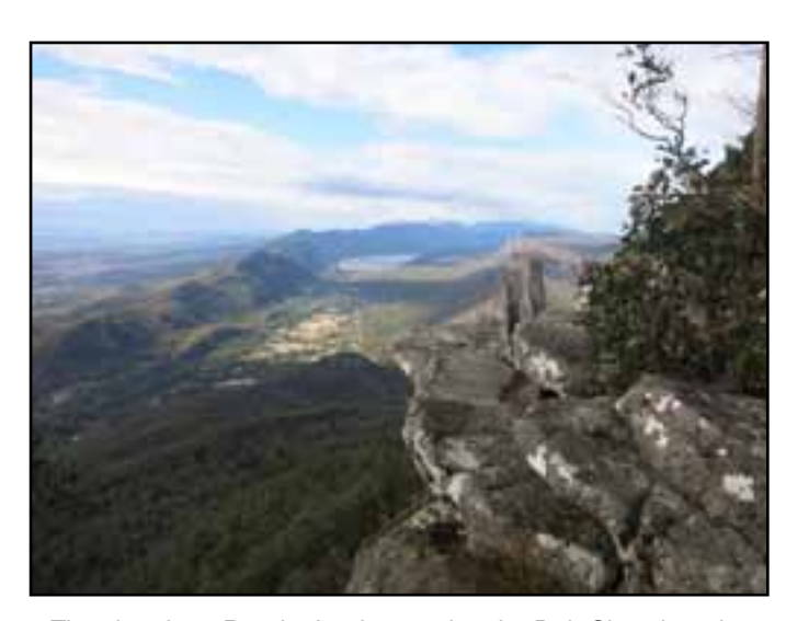
The view from Boroka Lookout, taken by Deb Shand on the Grampians track maintenance weekend, May 2015