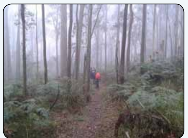
Disappearing into the mist.

State Forest. Due to a large part of the Beeripmo track running along the mountain ridgeline, the weather conditions meant that the majority of the walk was quite literally done in the clouds. The first day was mostly a descent from the highest point of the walk circuit down to the surrounding plains. The highlights of the day were passing beautiful gullies of forest ferns and even a quick view of