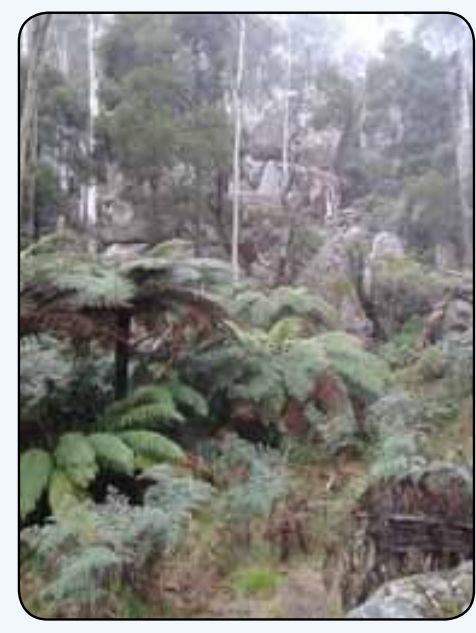
Through the rock garden.

The second day began with breakfast talk about an owl and kookaburra having a contest during the night to see who could make the most noise. The writer of this article slept through the contest but apparently it was pretty impressive. The walk on day 2 led the group back up onto the mountain ridgeline after which we slowly climbed a number of hills as the ridgeline ascended higher. Although the weather was cold and wet, the views of richly-green woodlands engulfed in rolling fog were truly stunning and worthy of belonging in any nature calendar. A number of black-tailed wallabies were spotted along the way as well as a mob of kangaroos. At one of the lookouts, there