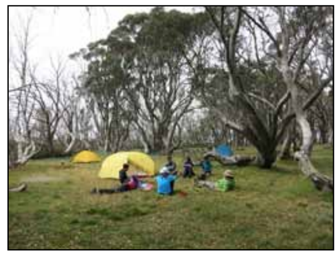
Melbourne Bushies camped near Roper's Hut, Bogong High Plains, March 2015