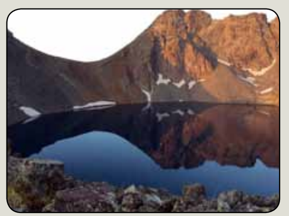
Lake Denz and Mount Kackar, Turkey

Walks in Turkey include The Laycian way (Likya) situated on the south coast and Mount Kackar. The Kackars are impressive ragged mountains running parallel to the Black Sea southern shore.