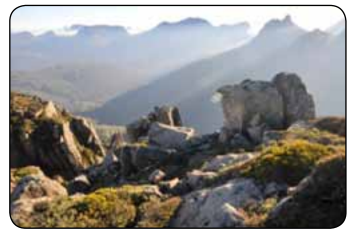
Mt Ossa and Hyperion, from Walled Mountain.