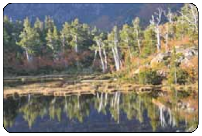
'Pool of Memories', north of the Labyrinth.