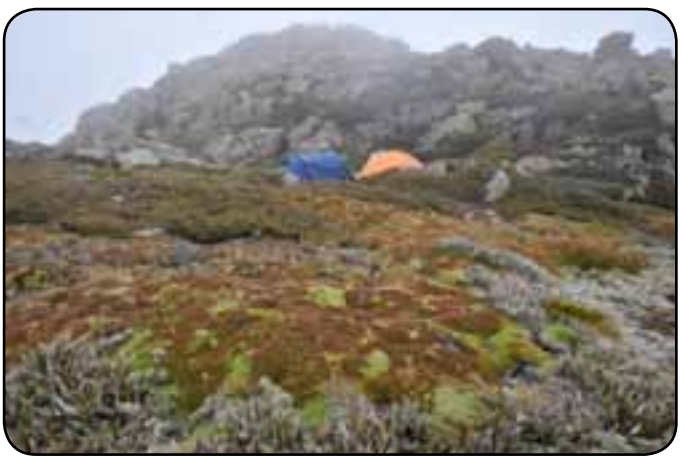
High camp among the cushion-plants on Walled Mountain.