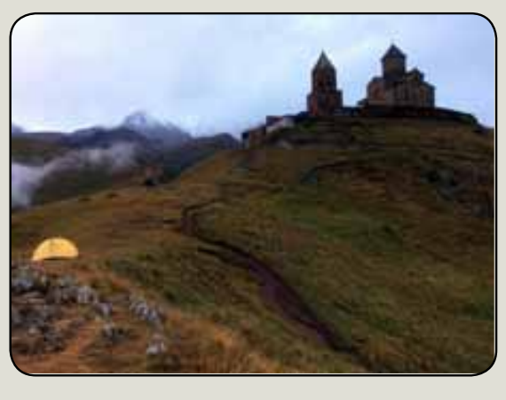
Gergeti Trinity Church (2170 metres), Georgia

Trekking in Georgia (Mestia – Ushguli) passes through several traditional Svan villages, White Mountains peaks, glaciers and fast deep rivers. My other walk in Georgia was in Kazbegi area (Stepantsminda – town) and land mark Gergeti Trinity church and Glacier close to Mt Kazbek. It was a fascinating experience which I'd like to share with you.