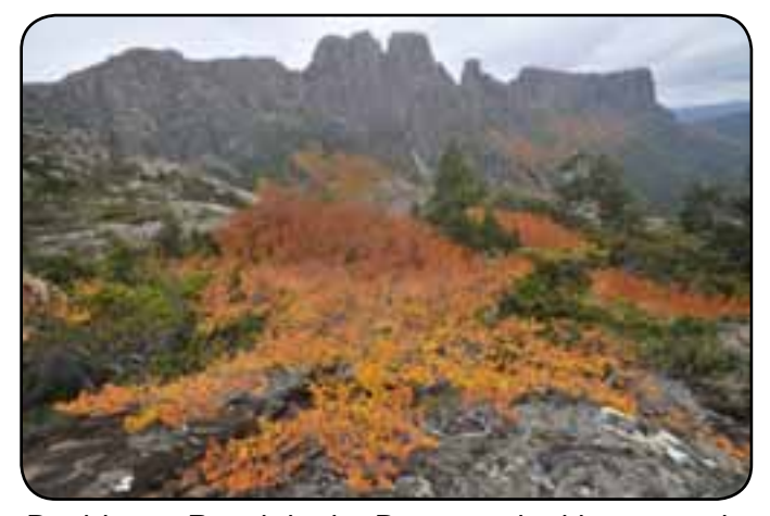
Deciduous Beech in the Ducanes, looking towards Mt Geryon.