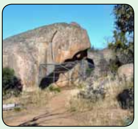
Cave in the Black Range

Check out the website <u>www.fedwalks.org.au</u> for more details about walks and please contact Mark Heath if you are interested.