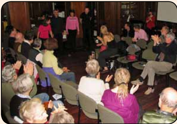
A lighter moment in the Officer's Mess

This functional and utilitarian building has two large drill halls with offices along their northern side. The drill halls are separated by a public entrance foyer which leads off A'Beckett Street. The principal entrance is in A'Beckett Street, and it is here that 'Army Medical Corps' and the badge of the Corp are pressed into the cement cornice. Of the numerous additional entrances to the east and west, one on William Street leads to the Officers' Mess.