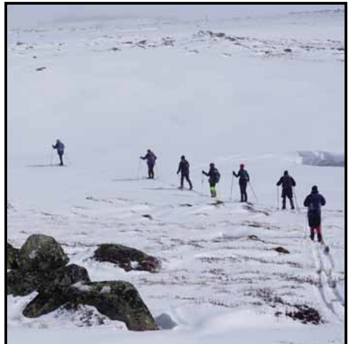
Skiing group – see article on page 9.