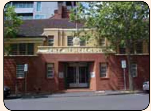
RHSV entrance on A'Beckett Street

It is in this environment that the RHSV maintains its commitment to the collection, research and sharing of an understanding of the history of Victoria. One of the RHSV's greatest assets is its unique ability to offer personal advice and assistance to individual researchers. Members and members of affiliated societies have free use of the collections; non-members pay a daily research fee.