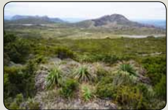
Looking north over the King William II Plateau.

Second, an ascent of the King Williams – another remote, high alpine plateau, rarely visited, just south of the Lyell Highway. It was reached via a tough, hazardous climb over Slatter's Peak, described in the Abels Guide to Tasmania's high alpine peaks as 'not for the faint hearted'.