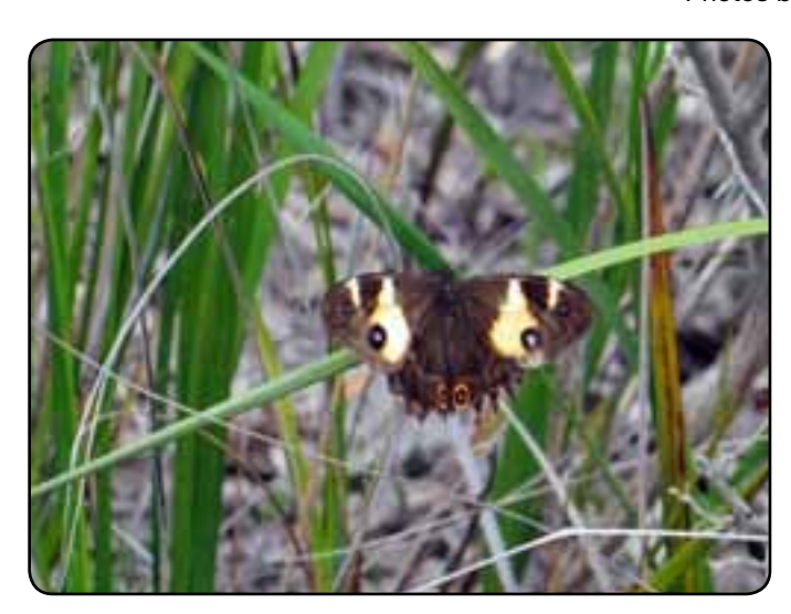
Multi-coloured butterflies wove in and out of the surrounding shrubs and grasses.