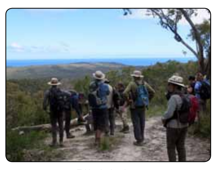
Taking in the views

Due date for contributions (including March previews) to February News: 21 January