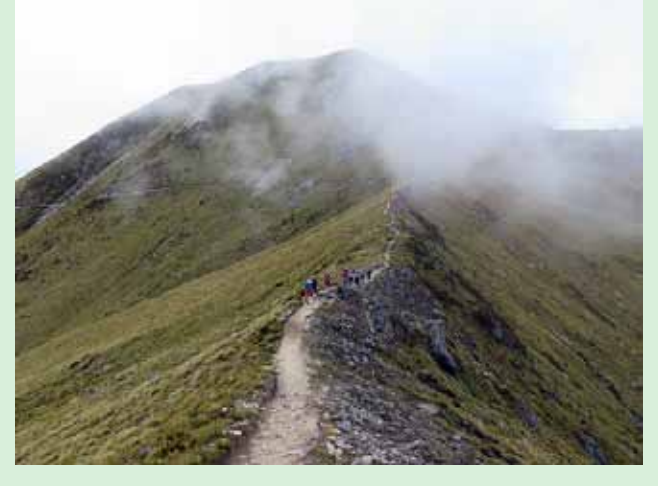
On the Kepler Track

To express interest in joining the group or for further information please contact Ian Mair. As the Kepler Track is part of the New Zealand Great Walks network it can only be walked with prepaid reservations. A party size limit of 8 will apply.