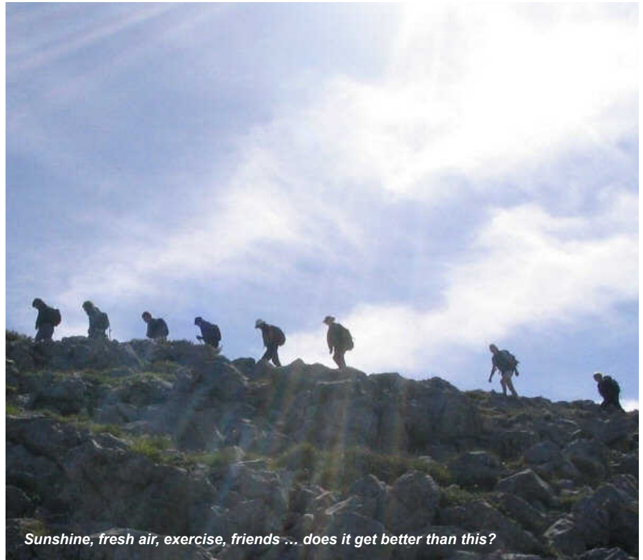
Sunshine, fresh air, exercise, friends ... does it get better than this?