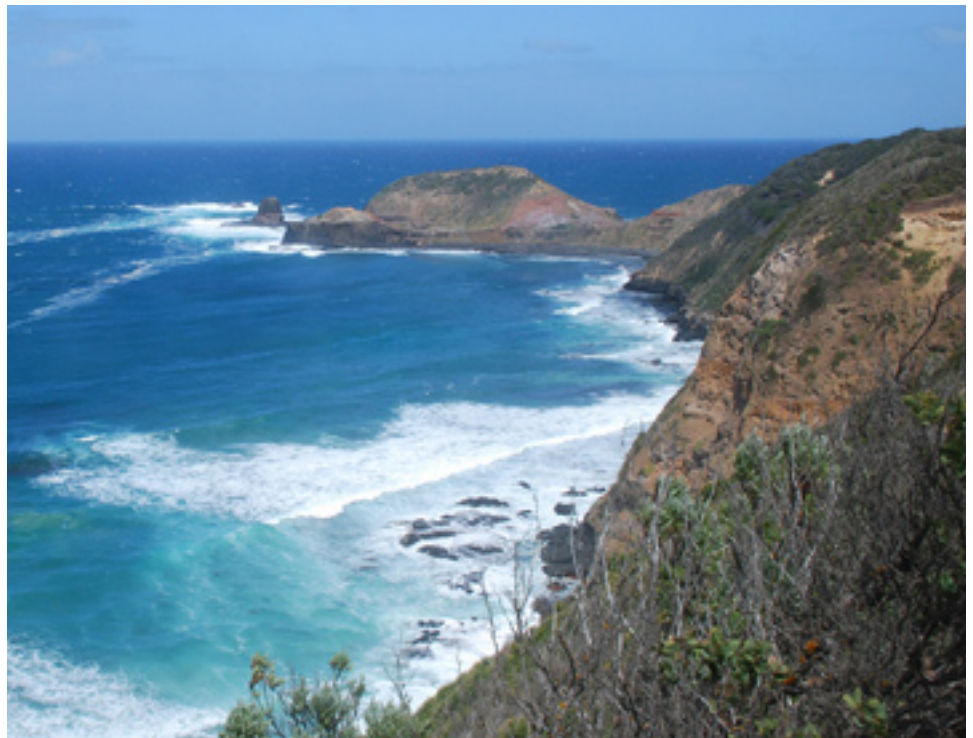
The view from Bushrangers Bay to Cape Schanck. Left: Greens Bush; and, below, walking the Two Bays Track to Bushrangers Bay

Perhaps the best aspect of the Two Bays Track is that it gives two days of interesting walking with a minimum (only about 1.5km) of suburban street walking. There is much diversity in vegetation and scenery and the views of Port Phillip and parts of Melbourne are superb. This was the first time that the Stringers had led a walk and hopefully it won't be the last. The group dynamics was good in spite of, or possibly because of, at least one generation gap and a diversity of fitness levels. The younger Stringers were conspicuously at the front for much of the time and on Sunday the older Stringers transferred some of their load to the younger folks' packs, but it didn't seem to slow them down. Thankyou Michael and Susan. The group was Michael, Susan, Callum, Briony and myself.