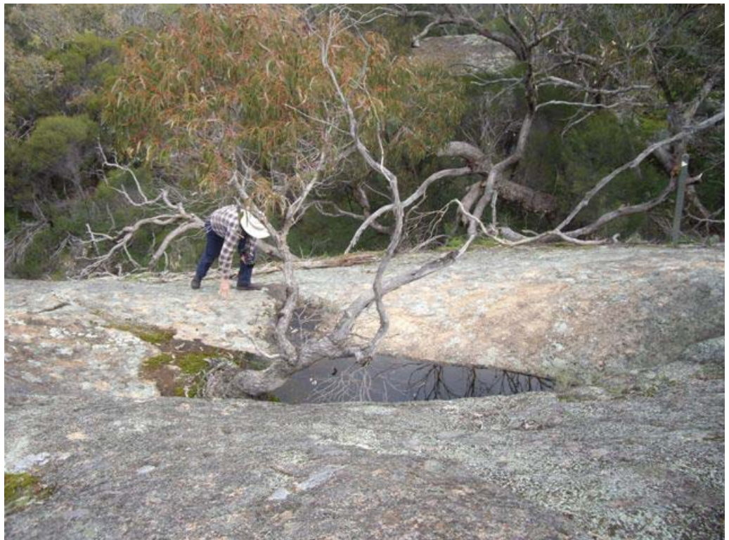
Tricky climb: Some of the rocks on Mt Kooyoora were quite slippery.

On Sunday we explored Melville's Caves, which are a series of large holes underneath balancing granite boulders.