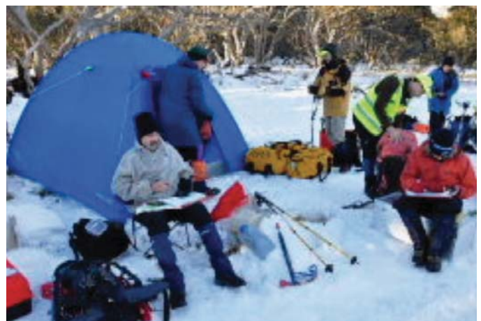
from Behind the Log , November 2010