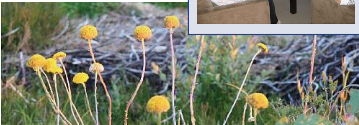
Billy Buttons on the Bogong High Plains