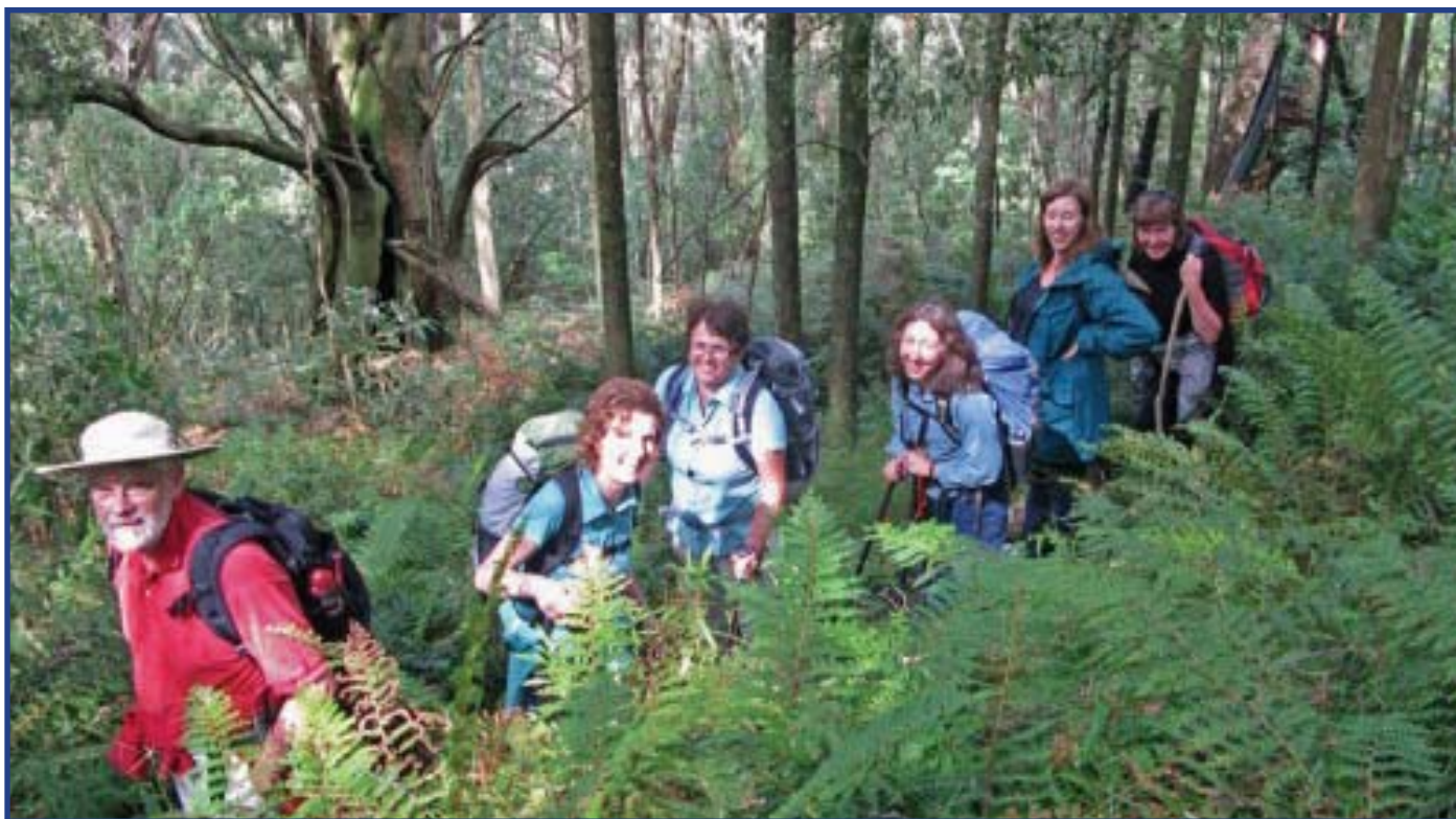
Mt Macedon circuit walk, Sunday 6 February.