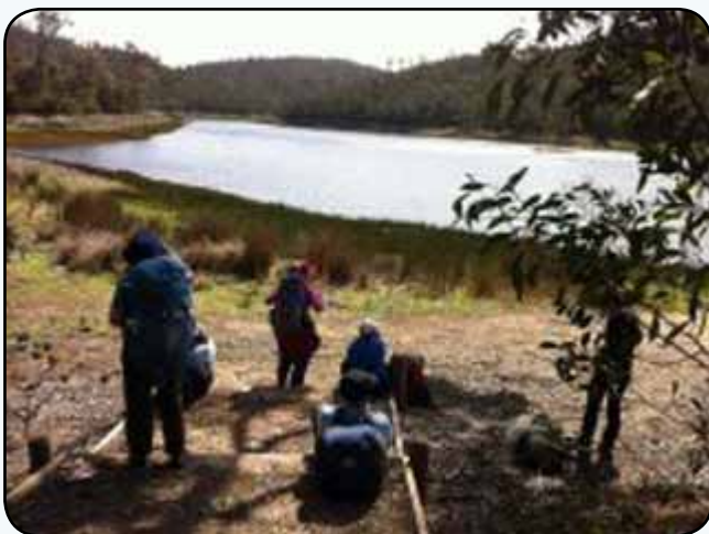
Stony Creek Reservoir