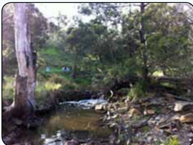
Saturday's riverside camp