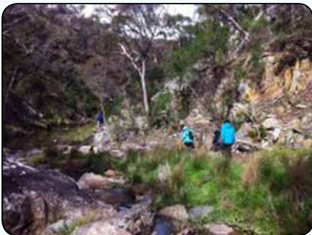
Little River Gorge

The weather report for the start of the Brisbane Ranges pack carry was rather ominous.