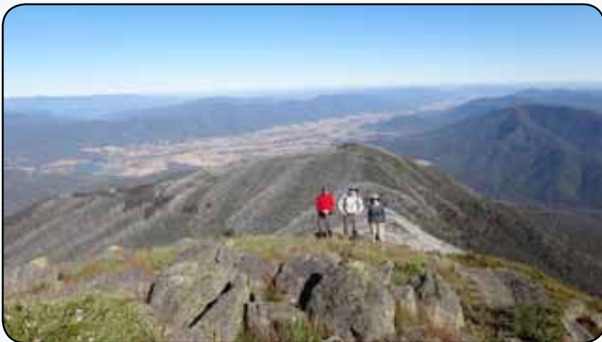
Exploring the Bogong horseshoe

leg muscles to the summit at 1986 metres. 'Go at your own pace' said leader Claire, 'and we'll have morning tea at Bivouac Hut'. I quickly lost view of the greyhounds of the group, only finding them at the hut. By then I was rather hot and my legs were grateful for a rest. The hardest bit was yet to come – the track becomes decidedly steeper and as I got to about 1800 metres the snow gums finished and then I suddenly faced up to a view of the summit approach. The memorial a little further on commemorates the deaths of three walkers caught out in a blizzard in August 1943,