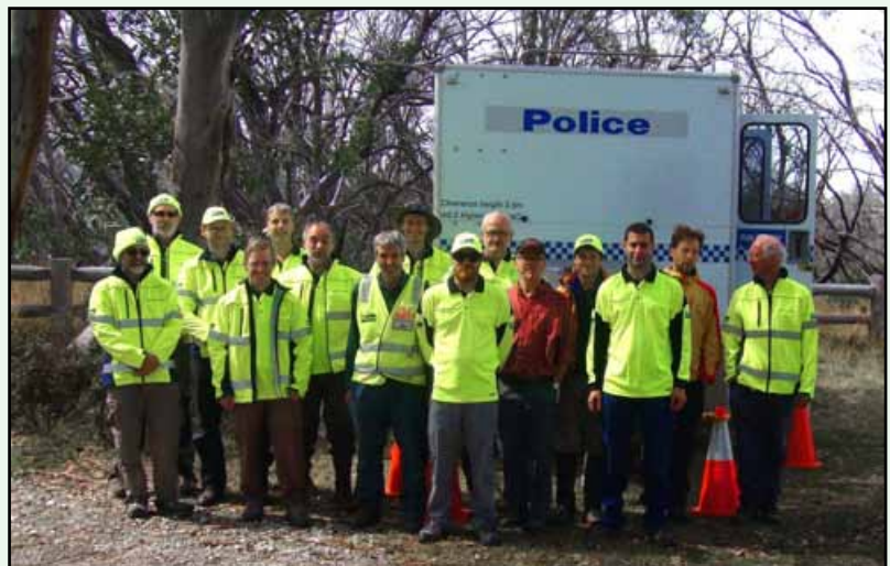
BSAR team at search conclusion of Howitt Plains search Sunday 23 March 2014

or training@bsar.org http://www.bsar.org