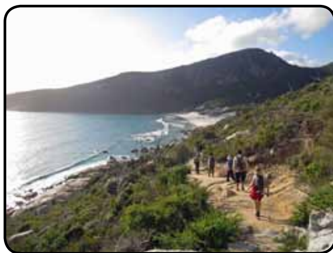
Working our way back up the western side of the Prom towards Tidal River only one more hurdle stood in our way.