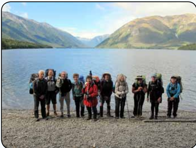
On the shores of Lake Rotoiti with Mt Robert to the left and the Travers River valley receding into the distance.

Although it can, and many do, be done in less time we also chose to spend six nights on the track stopping at each of the Serviced Huts along the way. These were comfortable, well-maintained and conveniently located. As circumstances had it the huts were generally close to capacity; however, advice from other walkers met along the way indicated that on the days either side of our schedule the huts were relatively empty! Even so we found room to play cards and appreciated the opportunity to share experiences with fellow walkers.