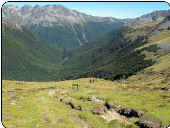
The track plunged steeply down towards the Sabine River valley.

Re-grouping at the saddle, we set off on perhaps the toughest section of the walk, a steep downhill plunge along sharp ridges and loose mountain scree. Exciting stuff! And the views down the valley towards the