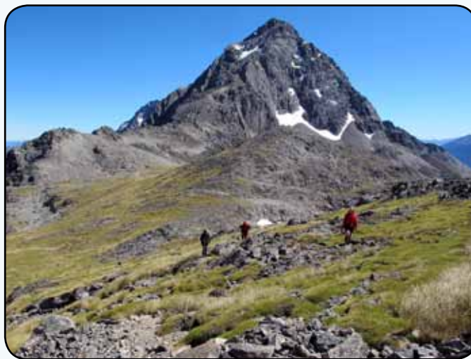
Mt Travers towered above as we explored the Travers Saddle on the way to find mountain tarns.

Invigorated and fit after completing the Heaphy Track, re-provisioned with gear fine-tuned after a break in Nelson, eleven of us set off in what promised to be good walking weather. Like many other walks through the spectacular New Zealand mountainous terrain our route on the Travers–Sabine Circuit would take us up one river valley, across a mountain pass and back down another valley. We chose the more traditional clockwise option travelling first up the Travers River valley and returning along the Sabine River valley.