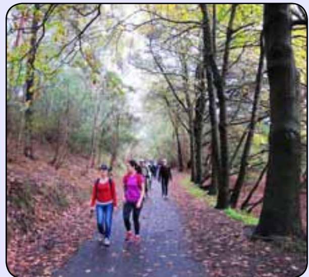
Yarra Valley Rail Trail, 15 June