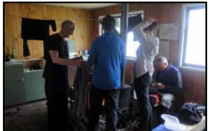
Drying out in Mt Wills hut at lunch time. Melbourne Cup weekend. See article on pages 7-8.

http://www.cfa.vic.gov.au/plan-prepare/vicemergency-app/