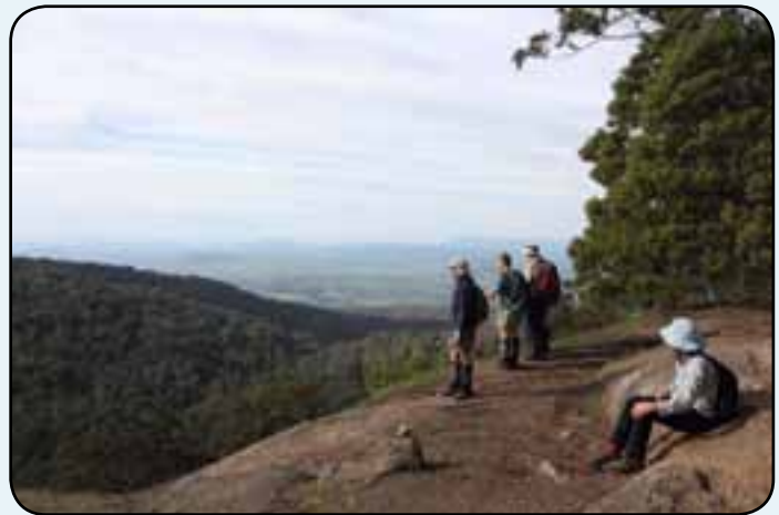
The crew enjoys the view from Golden Mountain