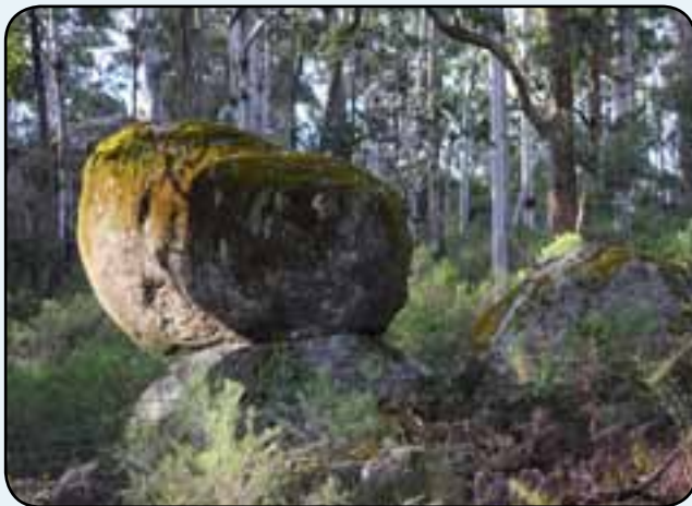
Huge granite tors are a feature of the Strathbogies