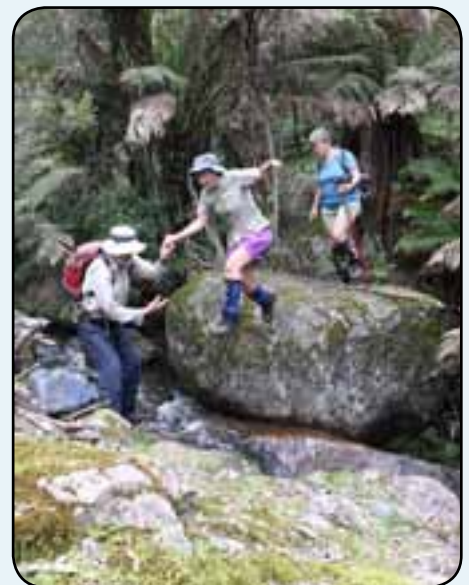
A leap of faith

Saturday night's camp was by another fine creek, with a full moon, mild temperatures, a boobook owl calling, plus some rice